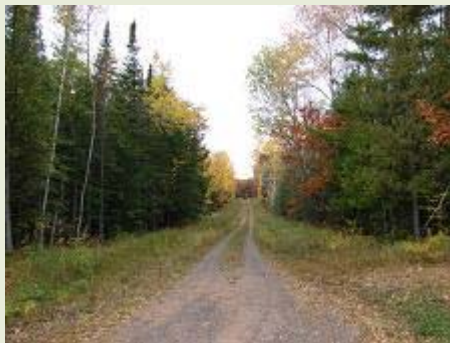
On the Road Again! Near Saxon, Wisconsin